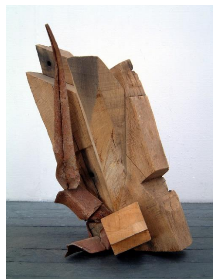
Clocher Tor , 2004, 71 x 40 x 20 cm