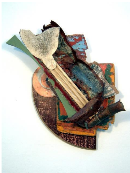
Les Fleures du Masonite , 2006, 46.6 x 52 x 15 cm