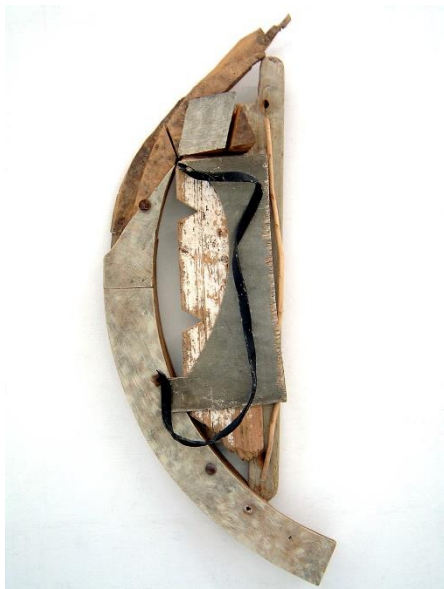
French Ark , 2004, 112 x 42 x 14 cm