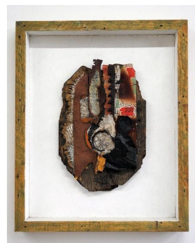
Jardinage, 1995, 71 x 58.5 x 7 cm