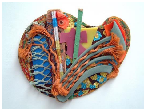
Stellarta , 2000, 51 x 63 x 6 cm