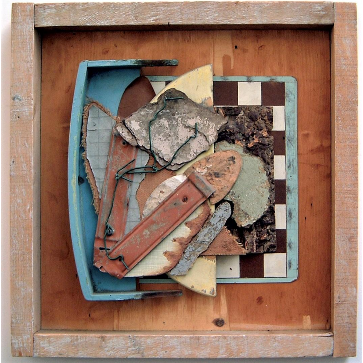
Ahnest du den Schöpfer, Welt? 1996, 72 x 72 x 7 cm