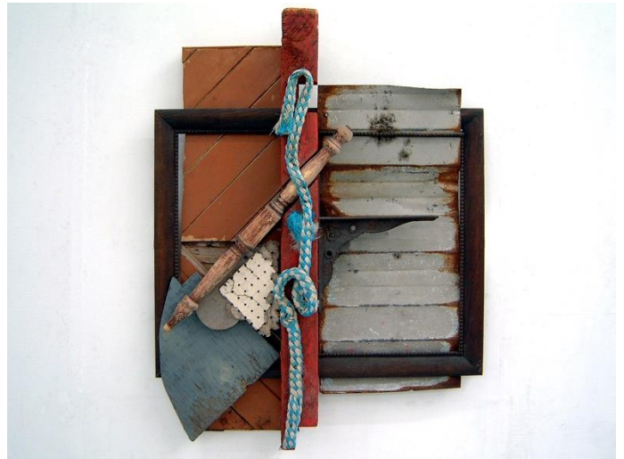
Al Magisti , 2004, 92 x 70 x 13 cm