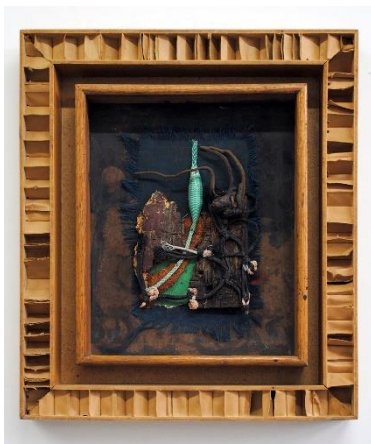
Boutros Boutros-Ghalie, 1996, 46.5 x 40.5 x 6 cm