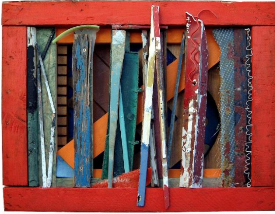
DE-SH3-490075 HT DB S, 2007, 52 x 64.5 x 16 cm