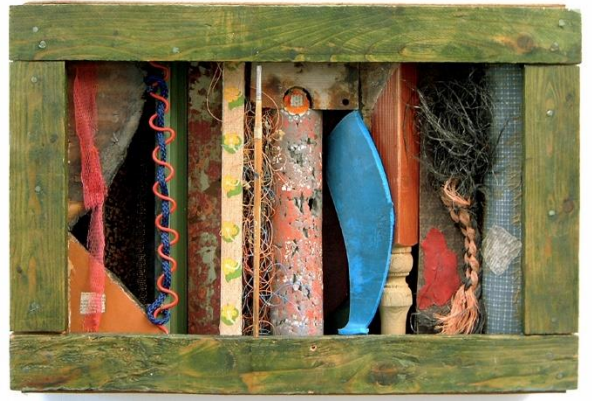
DE-SH3-490075 HT DB SG, 2007, 41 x 59 x 13 cm